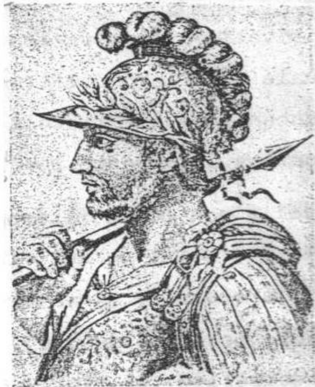
Arduino d'Ivrea